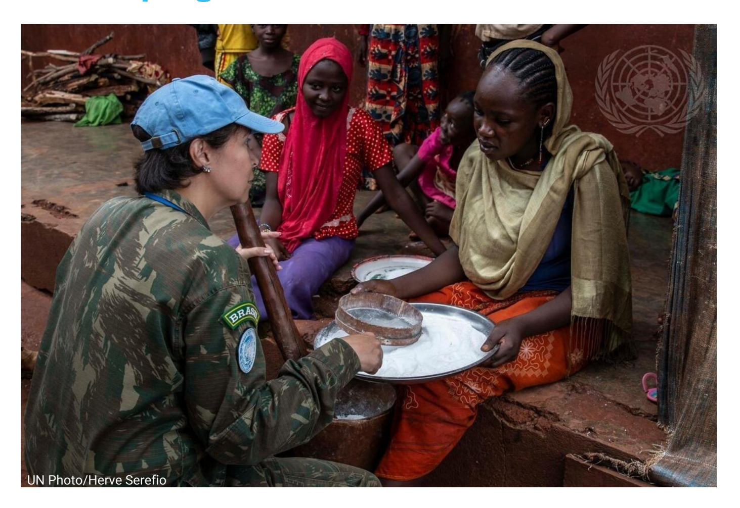
United Nations Peacekeeping helps countries torn by conflict create conditions for lasting peace.